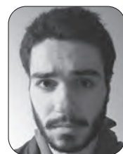
REPORTER/PHOTOGRAPHER Ty Dilello