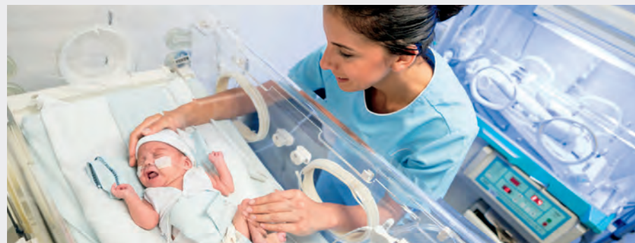
A level-2 infant nursery will be built as part of the expansion, reducing the need for families to travel to Winnipeg or Brandon to receive specialized care. The nursery area will also include a family lounge and spaces where parents who need to stay for extended periods can sleep and shower.