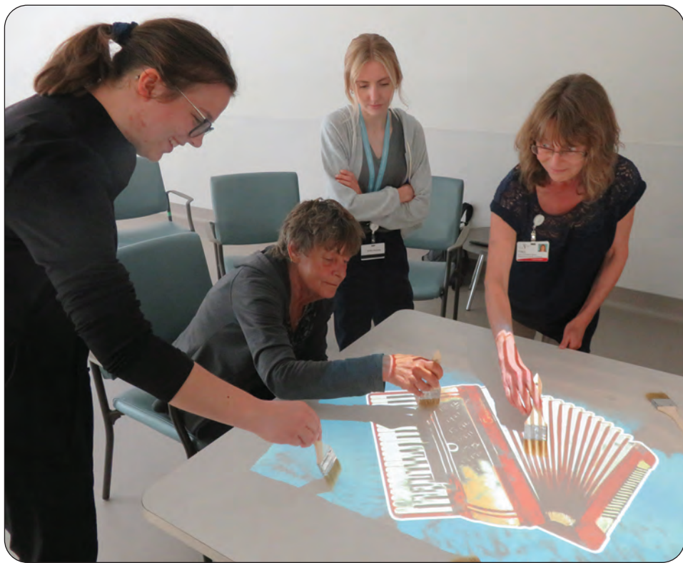
Lodge Activity Program staff "painting" a virtual picture.

The Voice Altmaia Rhineland The Voice Winkler Morden STANDARD