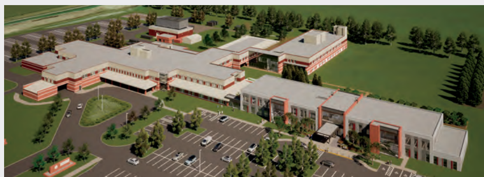
Aerial view of the current hospital with expanded facilities, including an additional 24 inpatient beds.

With the campaign nearing its $10 million target, the Board now invites the community at large to get involved. "We want everyone to feel like they have had the opportunity to be a part of this, to help shape and enhance healthcare in their community for years to come," Friesen adds. While meeting with each of the 220,000 people that rely on BTHC for care is impossible, the Board welcomes your questions and discussion about the expansion project. Watch your mailboxes for your campaign invitation and if you would like to discuss how you can more meaningfully participate in our expansion fundraising efforts, please give the Foundation office a call at 204-331-8808 ext. 2. You can also visit bthcexpansion.ca for a closer look at the services and programs that will be available once the expansion is complete. The future of healthcare at Boundary Trails Health Centre has never been brighter. Thank you for your continued support.